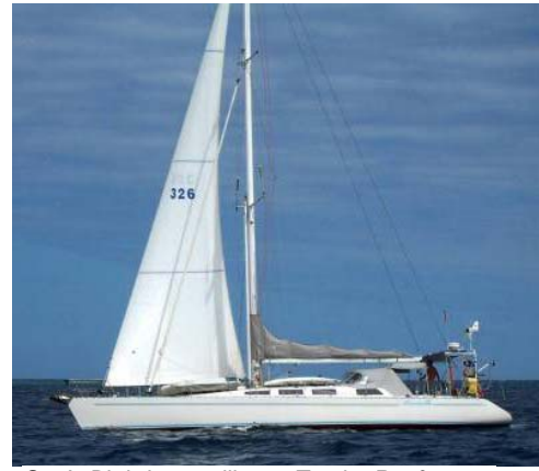
Sue's Birthday - sailing to Tambo Reef

The breeze held until Erromango Island where we were engulfed by heavy rain, thunder and lightning for about an hour. This weather was caused by an approaching high