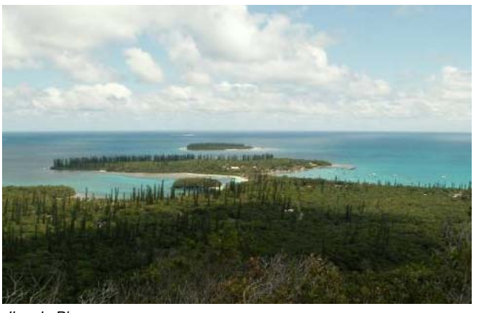
Iles de Pines

On our return to Noumea our linear drive on the autohelm became very noisy and after $350 overhaul by the