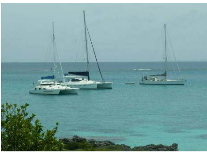
Tropical Cat, Cool Bananas and Aurielle - Rekabeco Cove, Maree Island

influence maybe). After two pleasant days we caught up with our friends on Cool Bananas (Legend 50 cat from NZ) and Tropical Cat (Windspeed 40) from Australia