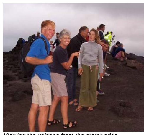
Viewing the volcano from the crater edge

atmosphere. The local islanders were quickly paddling out in their dugouts to welcome us, trade some vegetables and advise us of their island customs. There are some small accommodation bungalows on the southern cliff and a local 'Yacht Club' for cruising folk to gather in. Sandy, one of the locals, is the main contact for arriving vachts to gain clearance Usually it is departure help. necessary to take a 8 hour truck ride to Lenekal on the other side of the island but we were very fortunate, by the time we were to depart there were six cruising vachts in the bay so Customs and