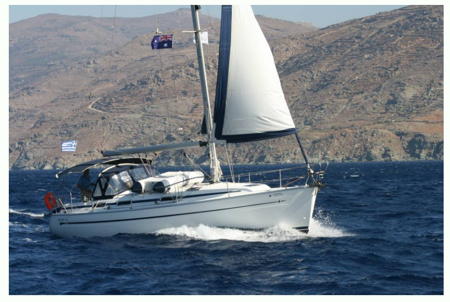
A stiff breeze in the Greek Islands. See article on page 26

Newsletter of the Cruising Yacht Club of Tasmania