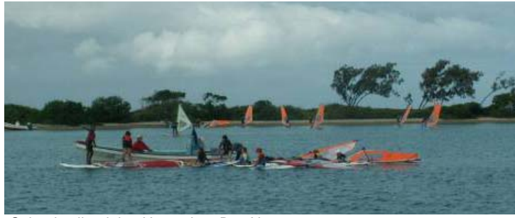
School sail training Horseshoe Bay Noumea

children would arrive to learn to sail as part of their school curriculum. There were Optimists, sailboards, Lasers and Hobie 16