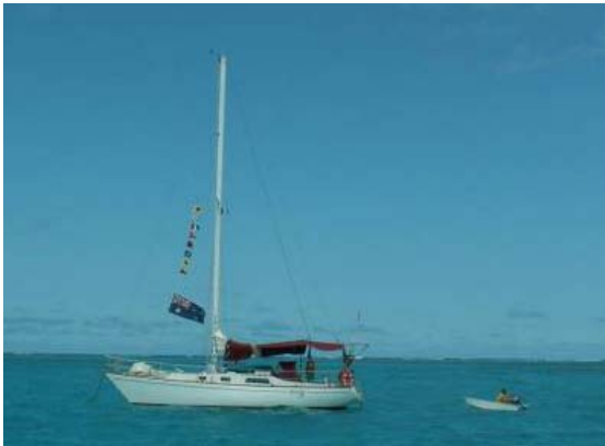
Intrepid 4 - Tambo Reef

The whole time we were at Tanna Island the SE trades had been in force, but with the possibility of a softening in strength, we left for Noumea approximately 290 miles away in a SW direction. It was a two sail reach (two reefs and a staysail) 20 - 30 knots with 2 -4 m sea