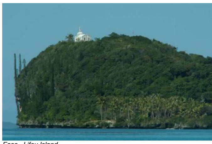
Easo. Lifou Island

To us Ouvea is the gem of the Loyalties. It is horseshoe in shape some 35 miles long with a nearly continuous white. sandv beach. The lagoon is three to twelve metres deep and well protected from the SE trades by the island. You can anchor anywhere along the shore in sand.