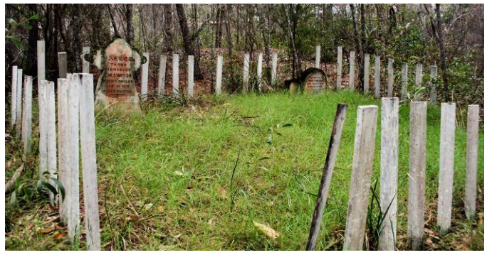
Sandy Cape lightstation graveyard

developed a new complaint bollarding back! The routine tasks such as mowing. checking on the Remote Area Power System (RAPS) and two diesel generators seemed easy by comparison! Erosion was also a problem. Every time we drove