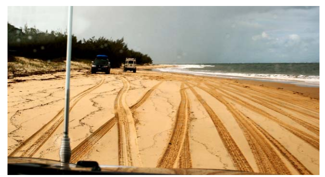
Sandy Cape beach highway

Other people must have been impressed, too, judging by the number of shipwrecks. Over 20 vessels foundered in the area before the authorities built а liahthouse. The light with its distinctive red dome