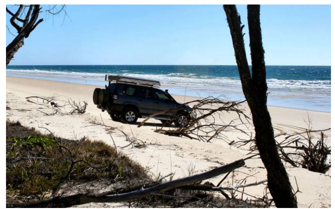
Sandy Cape beach

In between our scheduled weather observations we continued weeding – but NOT in the rain! We had developed a lovehate relationship with the Asparagus