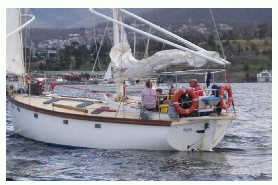
"Ailsa" – the Bain family on the Derwent

Newsletter of the Cruising Yacht Club of Tasmania