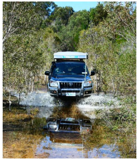
Eastern Firebreak after the rains

Matthew Flinders met some the local tribe of aboriginals when he landed just south