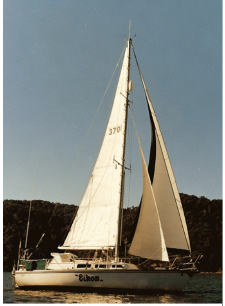
Eikon a triple diagonal Kauri, Allan Mummary design from NZ