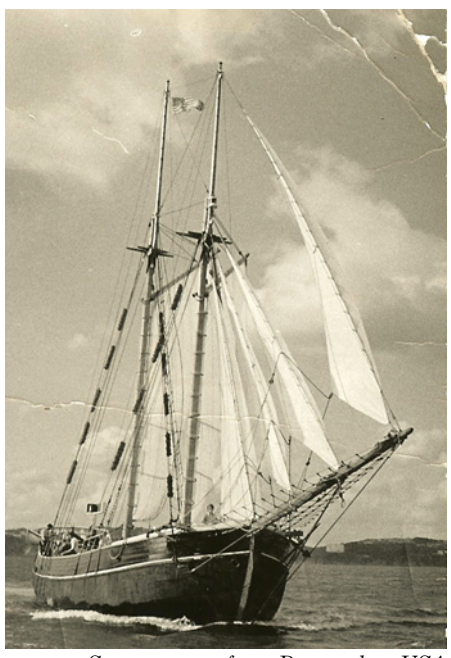
Sara en route from Denmark to USA