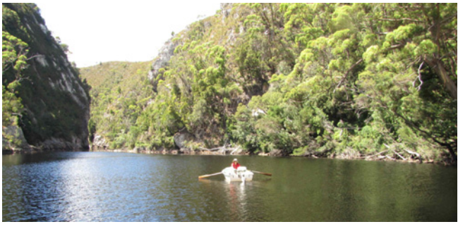
Davey Gorge (2)

day before we left, vegetables stored in paper bags, cryovacced meat, lemons in aluminium foil, dry goods and emergency canned stores all provided us with fresh food for the entire cruise. We were able to share meals with friends and take unexpected guests at short notice. We referred to the long-term store