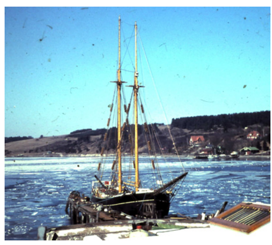
Sara waiting for the ice to clear. Hobro, Denmark

send a telegram back to base to expect to hear from us between 25 and 30 days later in Barbados, West Indies, all being well.