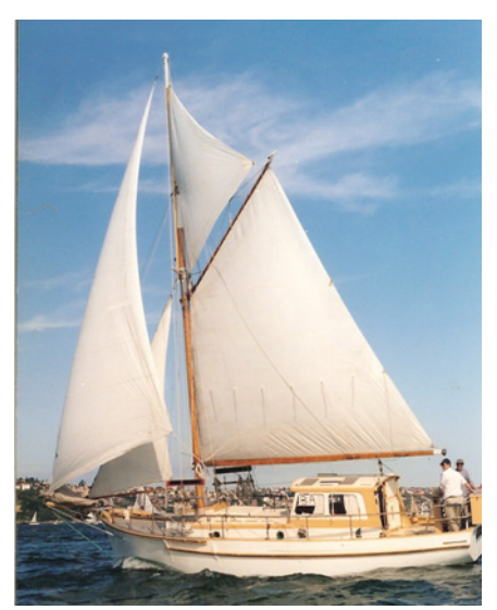
Boorowra - an ex-Eden fishing trawler