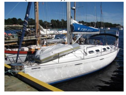
Mistral at Triabunna

calm of Bryan's Corner to catch a few crayfish and abalone. With a westerly change due, Mayfield Bay was chosen for shelter and crew change. With the second alternator (house) failing and the freezer thawing we instead retreated to Triabunna. The pleasant sail soon turned into a westerly gale, barely making progress as we motored to shelter at Louisville. Later, after re-navigating the dog leg entrance to Triabunna, we rafted up to K-Yacht-IC ' from Victoria. The suspected alternator fault was confirmed and an identical one was ordered from Launceston. Late afternoon on the third day it arrived but the mounting bolt hole was too small and had to go ashore to be drilled out. Finally fitted, good charge, cold beer (and food), we three left.