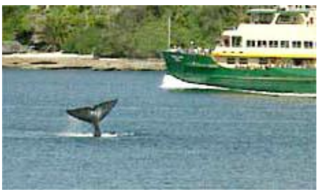
Alex shows off for Manly ferry passengers

Watching Alex, it was difficult not to get a sense of a significant intellect behind the behaviour, but more importantly perhaps, sense of emotional responses not far distant to our own.