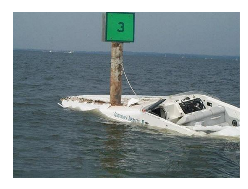
The name on the side reads "Temporary Insanity II". Reckon the insurance company will be convinced?