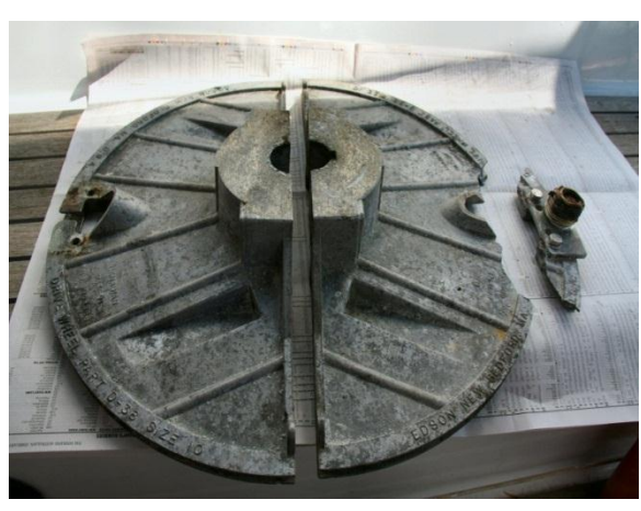
The shattered avadrant

Just to add to the complications, another pair of friends was flying in to join us. We had been in email contact and they knew