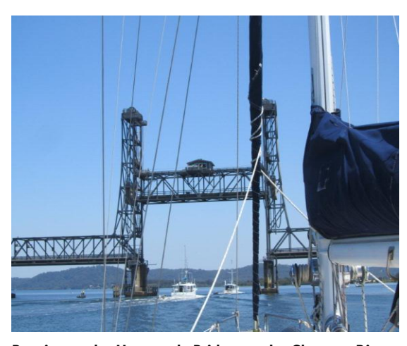
Passing under Harwoods Bridge on the Clarence River

We entered the Clarence River on a flood tide, making our way up past Yamba and Iluka to Harwood where we anchored overnight awaiting the opening of the Harwood Bridge. We arranged for an early opening next day with a simple phone call. The bridge is of a very similar design and could very easily be mistaken for our own Bridgewater Bridge. Carrying the Pacific Highway across the Clarence River, the road noise is constant. In hindsight we should have anchored a little further east of the bridge.