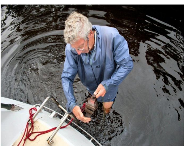
Fitting the vice to the rudder, ready to winch it free

rudder. The main problem was how to get enough leverage onto the back of the rudder. Suggestions included such things as lashing pieces of timber to all of which were complicated by the fact that even at low tide, the top of the rudder was barely above the very dark water. Inspiration finally came at 6 am on the 3rd day, on awakening from another restless night of worrying. We had a vice tucked away in the bilges. (One of my many vices, as my wife will tell you!). Once again, we backed the boat up as far as