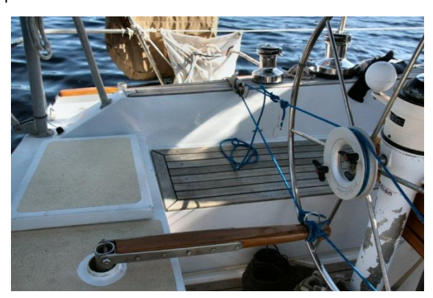
Jury-rigged steering - Mark II

jetty. The tackle was tied to the rudder using the vice as an attachment point and the line fed through the block and back to the main sheet winch. There was much creaking and groaning as the winch took up the load and everyone stood well clear. The jetty looked solid, but who knew if the pile would stand the pressure. Then suddenly the winch was winding in freely and the rudder was free. At high