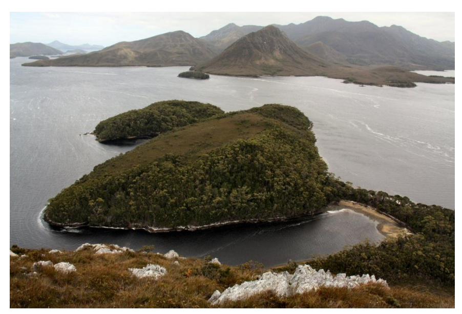
The bay from Balmoral Hill

No sweat. I grabbed the emergency tiller and fitted it in seconds. Easily done, but the rudder still would not move at all. It was jammed hard to starboard and wouldn't shift. We applied extra pressure to the tiller with a sheet winch, but nothing moved. To complicate things further, the anchor winch hummed away and dragged the anchor back to the boat, not the boat to the anchor.