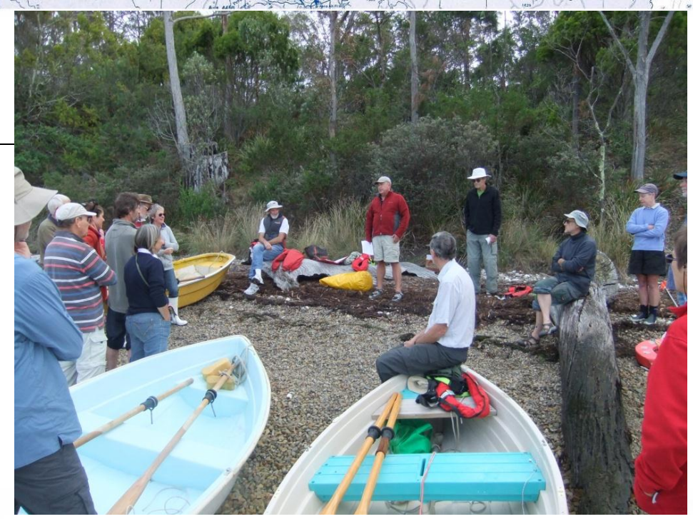
Discussing how to stay with the boat at the Crew Overboard Seminar