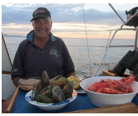
Meal fit for a King - or the skipper on his birthday

Friday 4th Nov. Day 152 since leaving Hobart, it's a glorious morning at Port Stephens and it is our 44th wedding anniversary. Spend the day exploring the town of Nelson, visiting a working craft centre, taking in the sights from the Inner Harbour Lighthouse. The VMR have a museum in the old light- keeper's house and open their volunteer station to visitors. Returning to the boat, we walked along the foreshore where the public facilities are first class. even to the extent where on one sheltered beach there is a