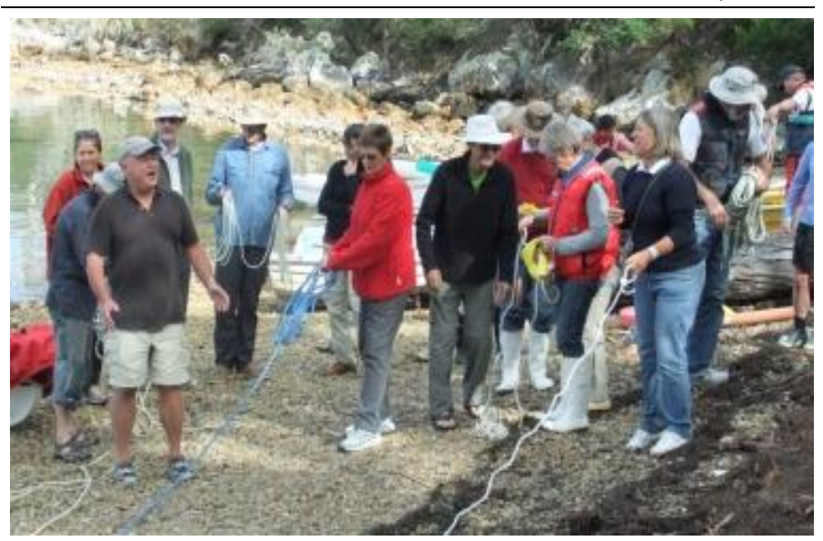
Budding cowboys throwing ropes on the beach