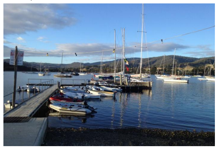
Dinghies at the Port Cygnet Sailing Club