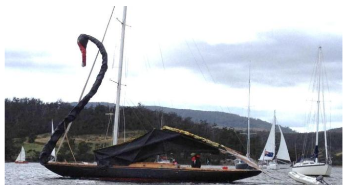
Cygnet's giant swan afloat