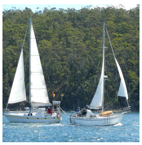
Ocean Child and Legend, both intent on finding their "Crew Overboard"