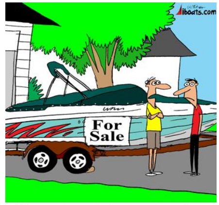
"I expect you to try to get me down on price, which is why I'm asking $1 million. But, I'll take less."

I look forward to handing you the keys (if I can find them) and wishing you well on your new endeavour. Love to hear from you.