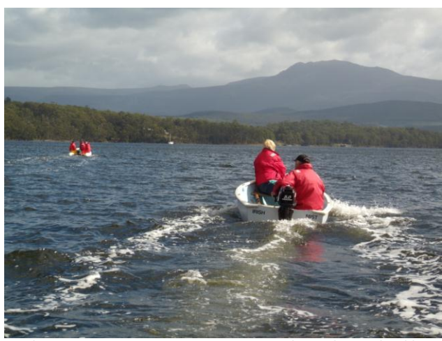
Exploring Lune River

Easter Sunday was for most. day relaxation. socializing. beach BBQ's and for the crews off three lucky boats, a dinghy trip up Lune the River. Members from Westerly. Irish Mist and Vailima explored the reaches of the Lune to the bridge marveling the at