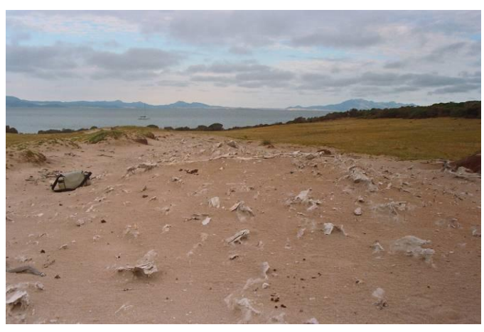
Wind blown rocks, Prime Seal Island

a weed free spot. I thought the initial anchor drop was clear of weed, but apparently not.