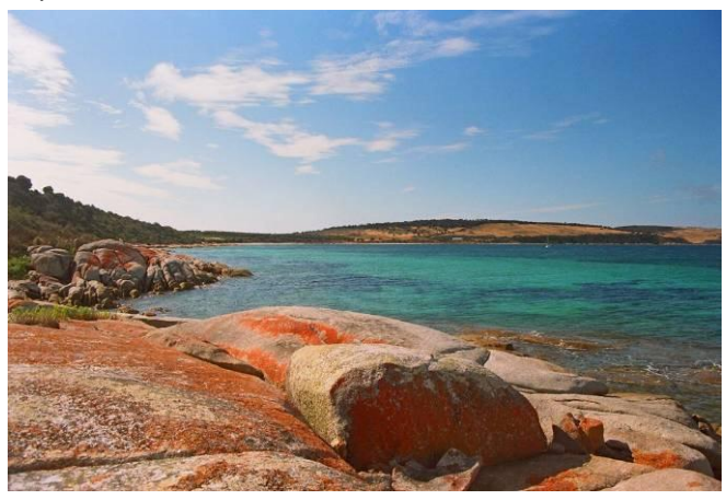
Prime Seal Island anchorage

Island off the west coast of Flinders There was thunderstorm late that evening, and the anchor dragged, but there was no danger it was blowing offshore. Up anchor in heavy rain and back inshore, only to drag again, but this time stopping when depth got to about Llm: must have found