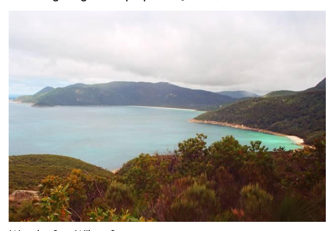
Waterloo Bay, Wilsons Prom

entangled, and being towed into (I think) Port Welshpool. They headed home under power for the Gippsland Lakes the next day, which was a sightseeing day for me, including climbing Kersops Peak (2 hours return) for photos.