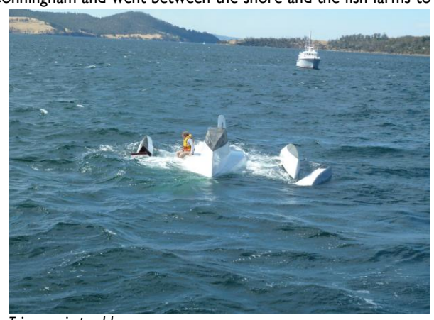
Trimaran in trouble

be in the lee of the land as it was blowing pretty hard from the west. lined up the top of Barnes Bay from the southern end of the fish farms. I noticed an unusual installation in the water. just Woodcutters Point. Аς we got closer a look through the binoculars confirmed that it was the trimaran we had seen earlier, except that the centreboard had swapped