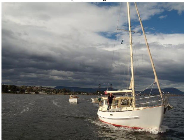
the now somewhat subdued Venus and took her in tow.

and under the Bridge Venus had no option but to press on to open water with the alarm screaming without mercy. The anchor was quickly deployed as the rest of the flotilla patiently waited till the span rose and rose, painfully but inexorably, to its maximum of 15.4m. Most of us felt the Bridge could well have risen a couple of metres further but as the boats scrambled through, few masts came to within two or perhaps three metres of the underside of the span, leaving some doubt as to its final height. Collectively we