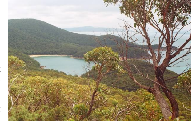
Refuge Cove, Wilsons Prom

Next day more 20k SW, so a boisterous sail to Refuge Cove, Wilsons Prom. Was there for two nights, and there seemed to be a procession of boats coming and going. One boat there the first night had been on her way to the Wooden Boat Festival, until being dismasted nearing Deal Island, getting the prop