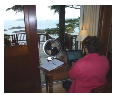
Editor hard at work in British Columbia

I'm looking forward to some winter cruising – hope to see you out there!