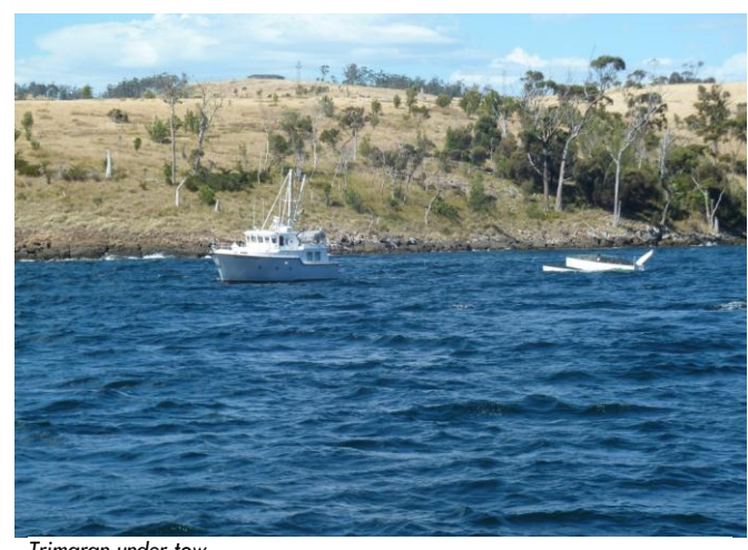
Trimaran under tow

suggested on airwaves to proceed Kettering take over the stricken oil-platform (that's what it reminded me of seeing it in tow behind Westwind) onto the wharf as he got it into harbour. Westwind was averaging 1.5 knots on the way across and the trimaran in tow was crabbing