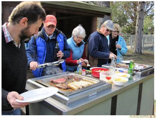
Enjoying the BBQ

A handful of club members enjoyed a day in the winter sunshine at the Waterworks reserve for the midwinter BBQ. According to Erika Shankley who sent in the pictures, there was plenty of hot air around too - not only from the BBQ but from the discussions around the picnic table!