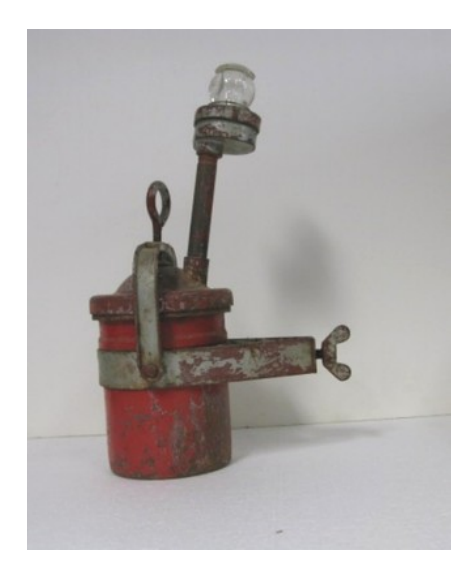
What was this item used for?

Here's a brain teaser to test your knowledge of maritime history.