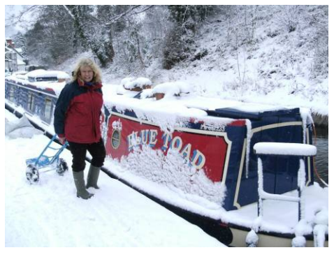
Moira and Blue Toad

Our lovely 31' Catalina is exactly half the length of our last boat, a fifth of its weight, a total contrast in every way to our gaily-painted narrow-boat Blue Toad that we recently lived on for three years. In Blue Toad we travelled 3000 miles, negotiating 2000 locks in 1000 days, surviving a very frightening flood on the River Ouse in York, fending off a whole tree at 3am. With only bicycles for transport on board, we cycled hundreds of miles on sorties into the picture-book UK countryside, and had the most