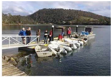
Dinghies at Nubeena