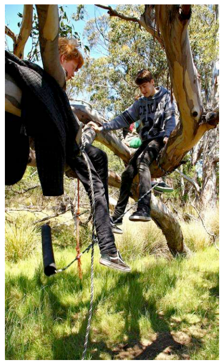
Boys will be boys