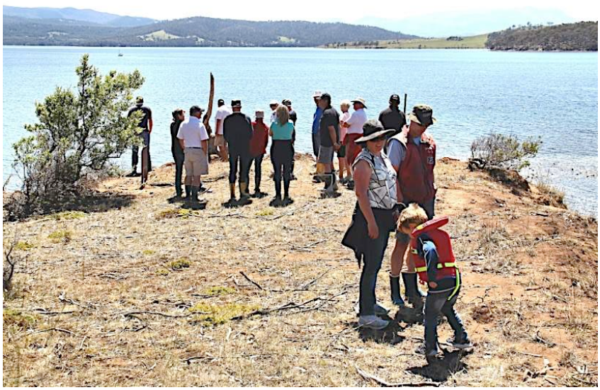
At Burying Point