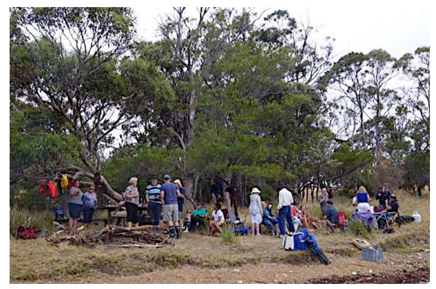
Lodge Bay cruise