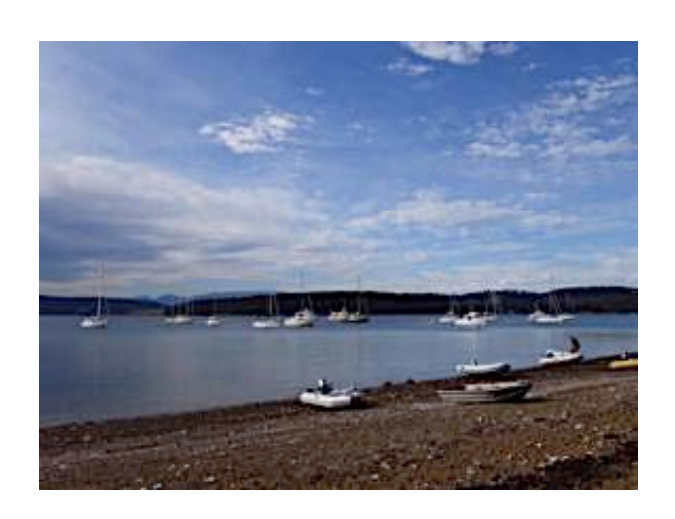
The fleet at Lodge Bay