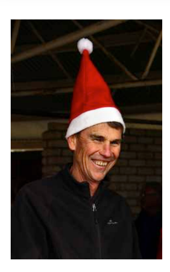
The Commodore celebrates