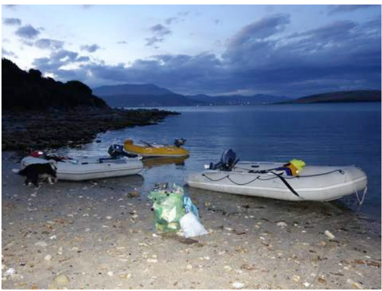
Tenders and bag of plastic litter