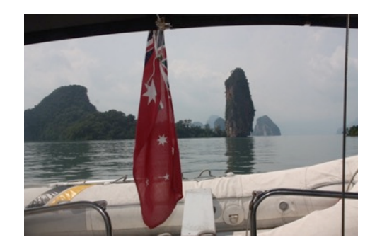
Phang Nga Bay