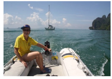
Exploring Phuket by dinghy