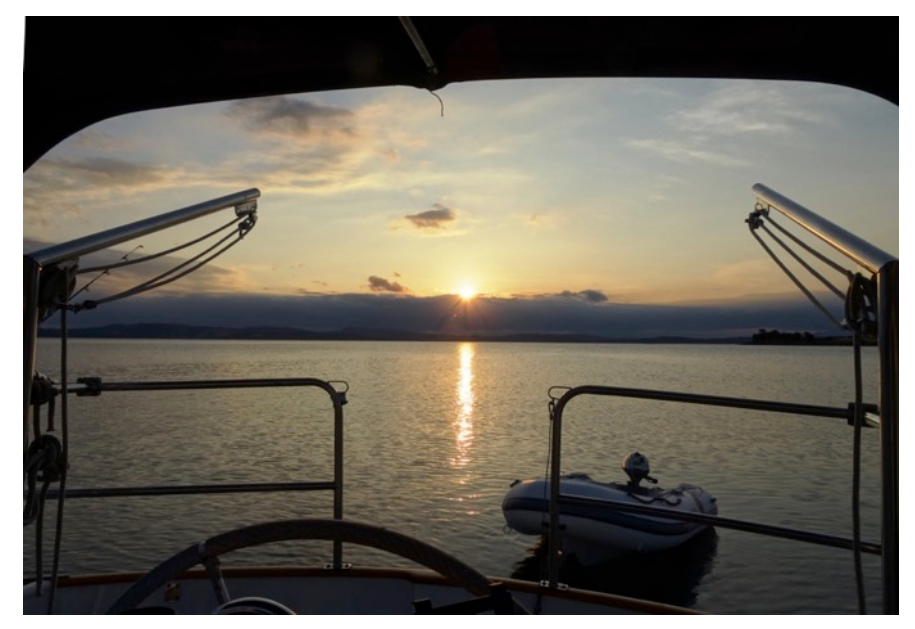
Sunset on Norfolk Bay from Rubicon