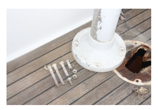
Refurbishing the steering just in time