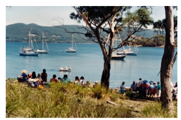
BBO Snake Island, 1994.

Fair Winds & Smooth Sailing will be officially launched at the Club's April meeting with copies available, free , to all Club members! Come along and pick up your copy of the history of YOUR club.