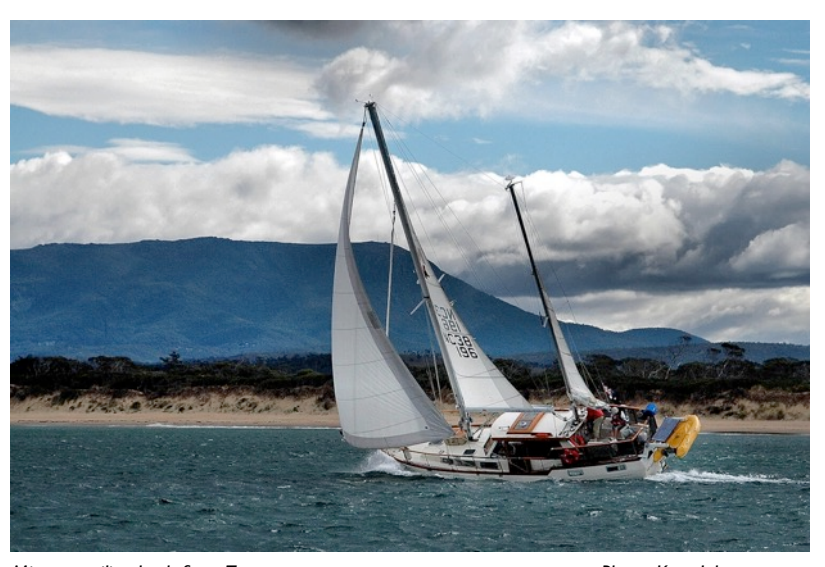
Minerva sailing back from Taranna