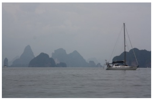
Phang Nga anchorage