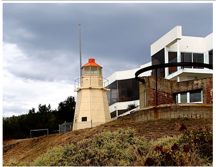
Blinking Billy Lighthouse, 2014