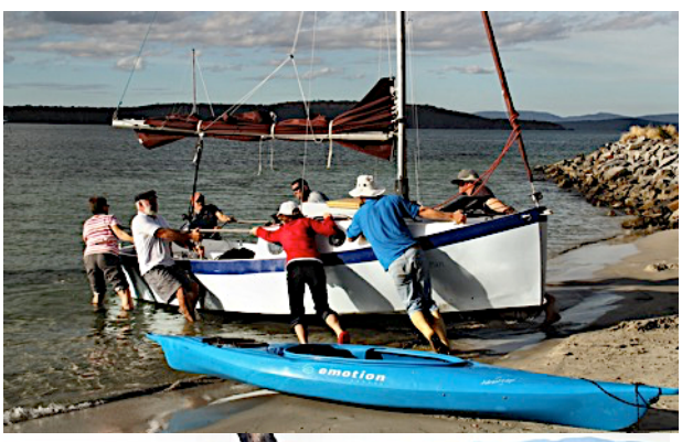
Assisting the trailer-sailer Pan which was hard ashore