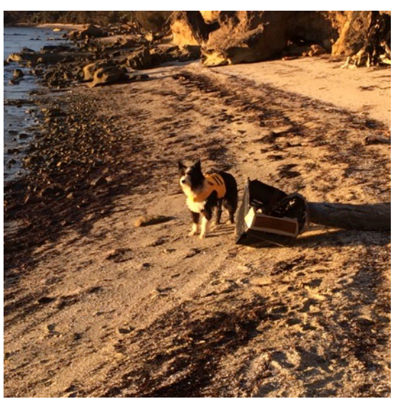
Pib finds tv on Monks Beach

It is good that the CYCT has a 'leave a Beach Clean' policy - I hope it becomes standard policy of all the boating fraternity not to litter and to leave visited areas better than when we arrive.