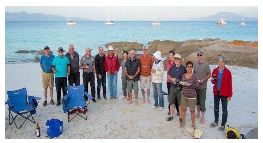
All crews at Badger Island.