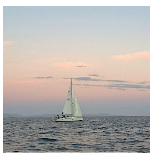
Tahiti under sail

So at the beginning of our cruising life we have spent most of this glorious summer sailing and familiarising ourselves with everything on board around Recherche Bay, the Huon and Channel areas, Storm Bay, Frederick Henry and Norfolk Bay in preparation for longer passages in the future. We've met lots of lovely, friendly people, many who have cruised for a long time. So if you see us on Tahiti sailing by, please say hello! "Here's to stopping and taking it all in."