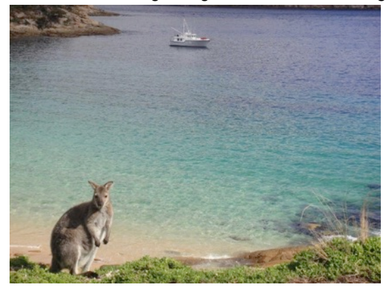
Deal Island at East Cove-Westwind

Some of the fleet, during the leg from Deal Island to Refuge Cove, detoured to the Hogan group