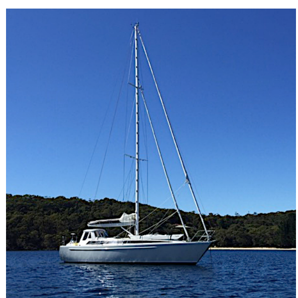
Cachalot of Hobart at anchor in Port Arthur

We plan to enjoy the wonderful world-class cruising Tasmania has to offer for the next few years, before heading off to distant shores for surf, sun and a life postwork.