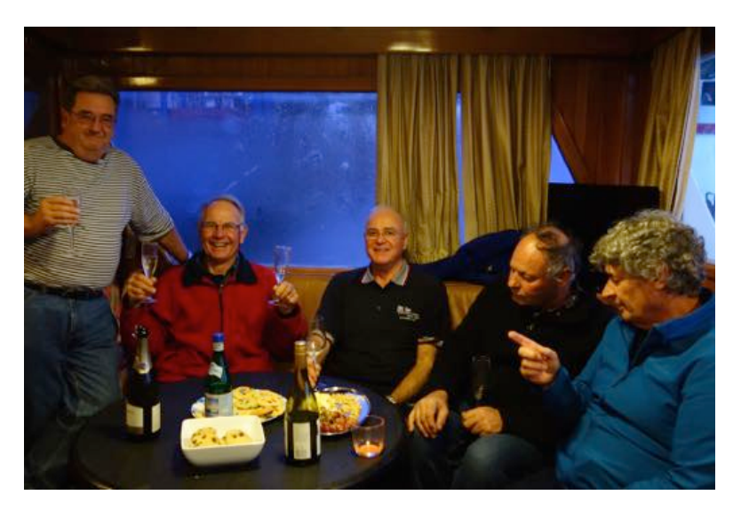
Serenade with champagne and the delicious results of wizardry from the galley