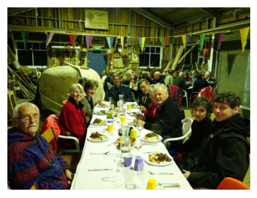
CYCT shellbacks dinning at the Living Boat Trust