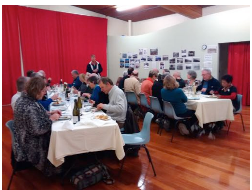
New members dinner: the Commodore makes his address