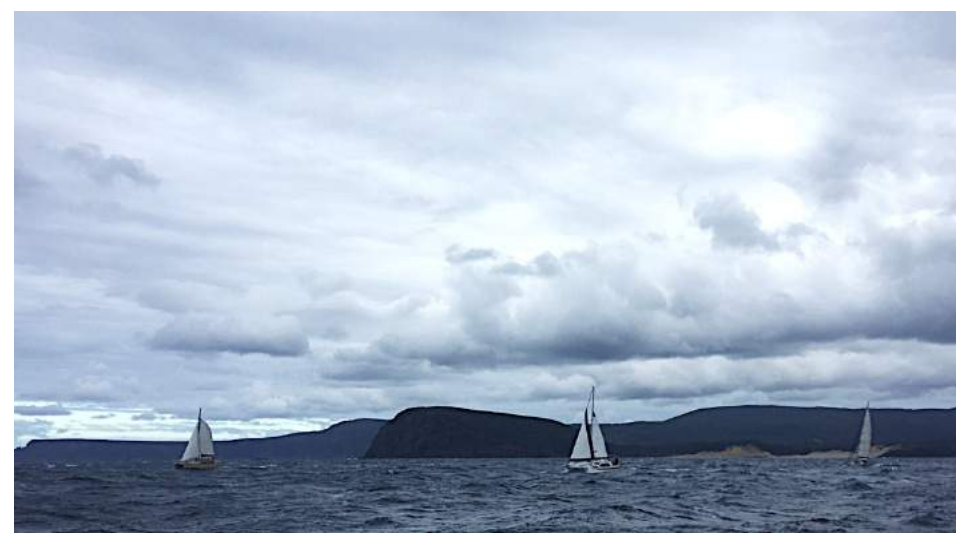
TwoToTango, Stella and White Rose I heading out of Port Arthur on a grey day