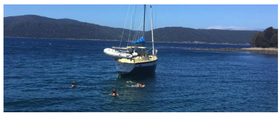
Swimming with Dina and Allan from Trim

We all arrived after a great sail without any dramas. We decided to anchor at Ladies Bay which is my favourite place in Port Arthur bar Safety Cove. The 34°C heat encouraged most to jump off their boat and into the aqua blue clear (and warm) water for a group swim. So lovely after such a day at sea.