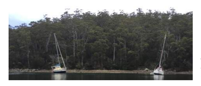
Trim and Cleo at the bottom of the tide just putting on a bit of heel

Cleo was first into Canoe Bay followed by all bar Pacific Haven which chose to anchor near the jetty. The large full moon meant that the low tide was very low. And canoe bay became a bit shallow. A couple of boats bottomed out on the mud when the tide bottomed out. Phil on Cleo had a good relaxed attitude which was sensible, "not much we can do we will move when the tide comes up" and move they did.