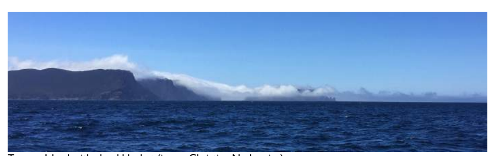
Tasman Island with cloud blanket

The wind was hot and humid. This gave rise to an unusual cloud blanket over Tasman Island and Cape Pillar.