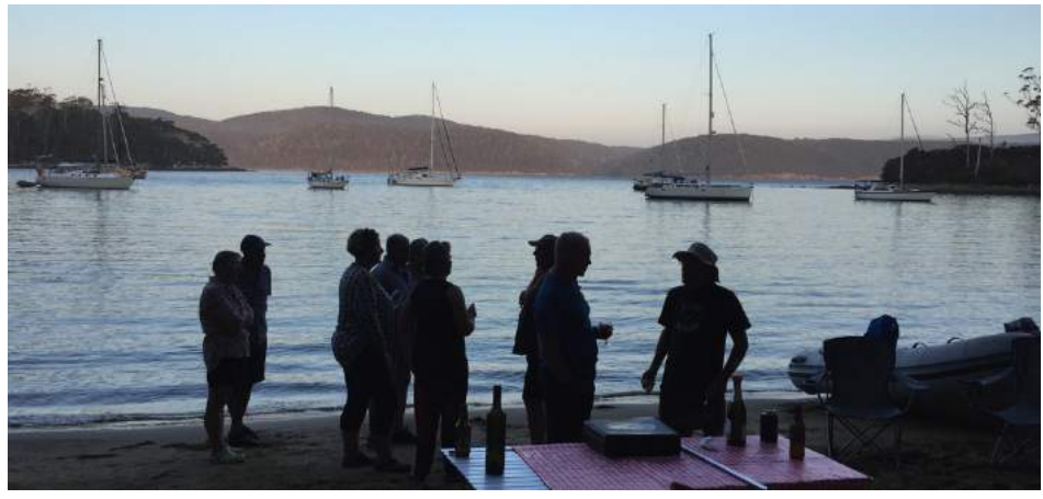
Post BBQ drinks on a balmy night in Lady's Bay

There is a good feeling of elation sailing in company. Its the reason I joined this club. Not to meet up but to actually travel the journey, share the tales of wind shifts and dolphins, laughter, share frustrations and tales at the end of a good days' voyage. So after a rest it was sundowners on the beach with everyone and also the crew off a cat from Melbourne on its way home, TwoToTango whose crew became honorary Club members for a few days. Fire restrictions meant the BBQ was a portable gas number. Very convenient having the lightweight butane canister burners available.