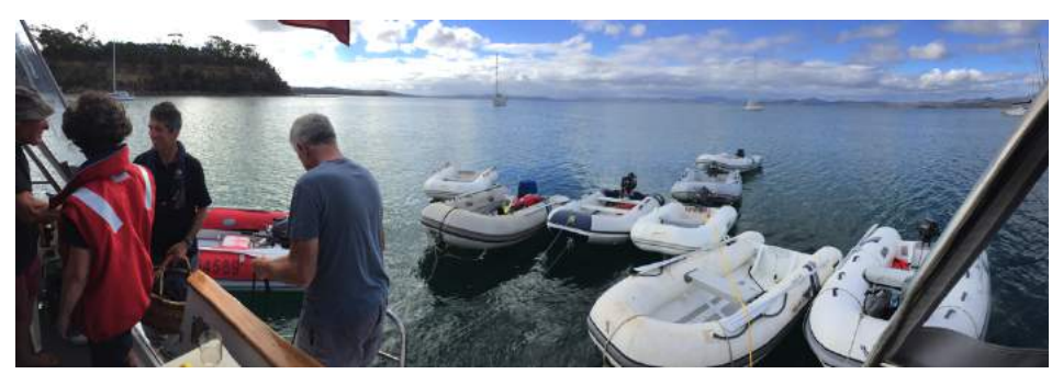
A gaggle of tenders attached to Crown Venture