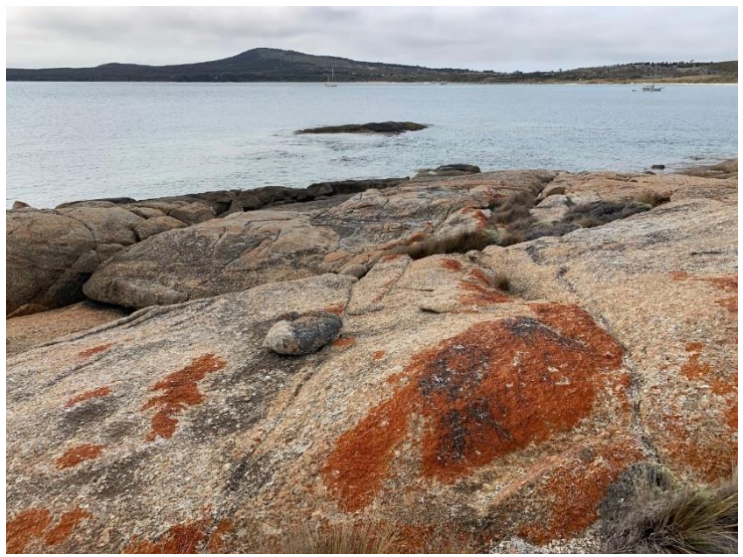
Thunder & Lightning Bay

Armstrong Channel separates Cape Barren Island from Clarke Island. The channel has very strong tidal flows with rips and overfalls. There are a number of anchorages including Horseshoe Bay S-NW, Hamilton Roads SW-NW, Maclaines Bay E-S, Battery Bay* N-ESE, Kangaroo Bay E-W and Kent Bay* W-E. However, most have poor holding and it is important to find the sandy patches. The area is best visited in light and stable weather in daylight. The channel presents an interesting shortcut between the Cape Barren area and Thunder & Lightning Bay at slack water or with the tidal flow which floods to the west. At this stage we are not planning to transit the Armstrong Channel.