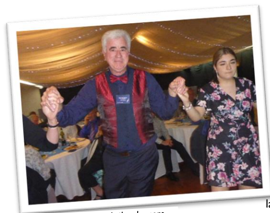
The VC joins in with the dancers

In readiness for the 48 th Anniversary Dinner please feel free to get in touch with me and share your thoughts on what we can get up to next time.