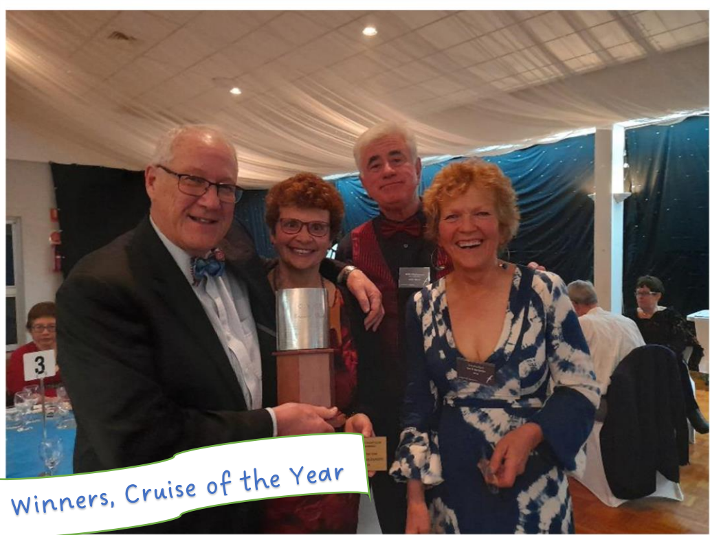
Winners, Cruise of the Year

Newsletter of the Cruising Yacht Club of Tasmania