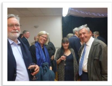
Pre dinner drinks

Fifty five club members and two guests attended. Some tried the Greek retsina wine for starters and enjoyed the softer flavour than we remembered from visits to Greek Islands during our younger days. The spannikopita along with the cheese pies were well received while members caught up with old friends.